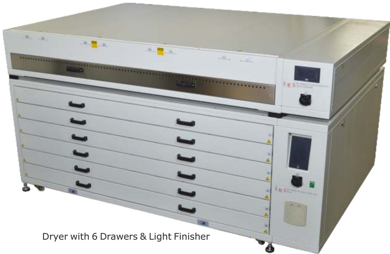
Dryer with 6 Drawers & Light Finisher

3ES-PROII-D is designed for drying photopolymer plates up to a format size of 920 x 1200 mm.